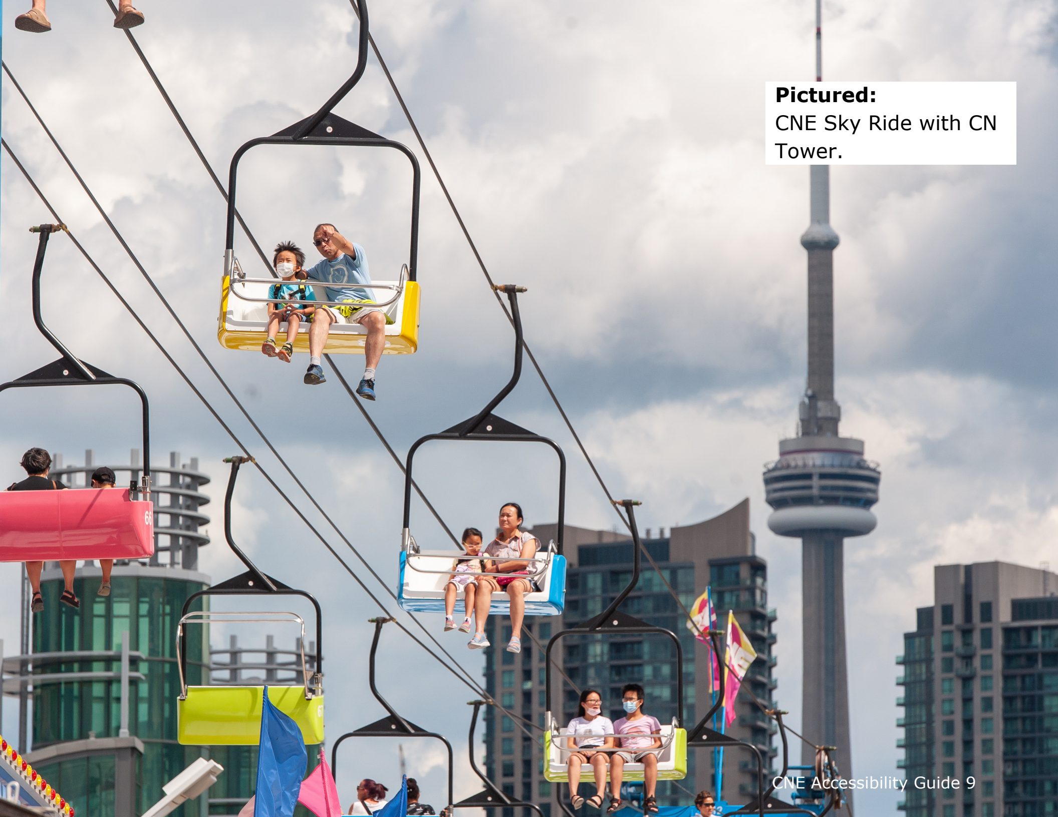
Pictured: CNE Sky Ride with CN Tower.