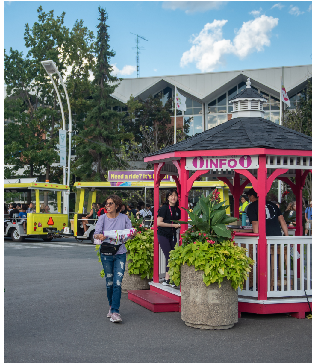
Pictured: CNE outdoor Information Booth with Guest Services Staff.

Refer to map on page 36 & 37 for locations