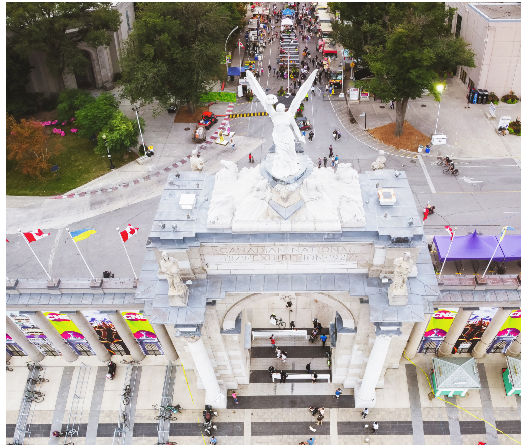
Pictured: Princes' Gates with CNE crowd in background.

Please refer to the Services and Amenities section for information on Animal Relief Areas.