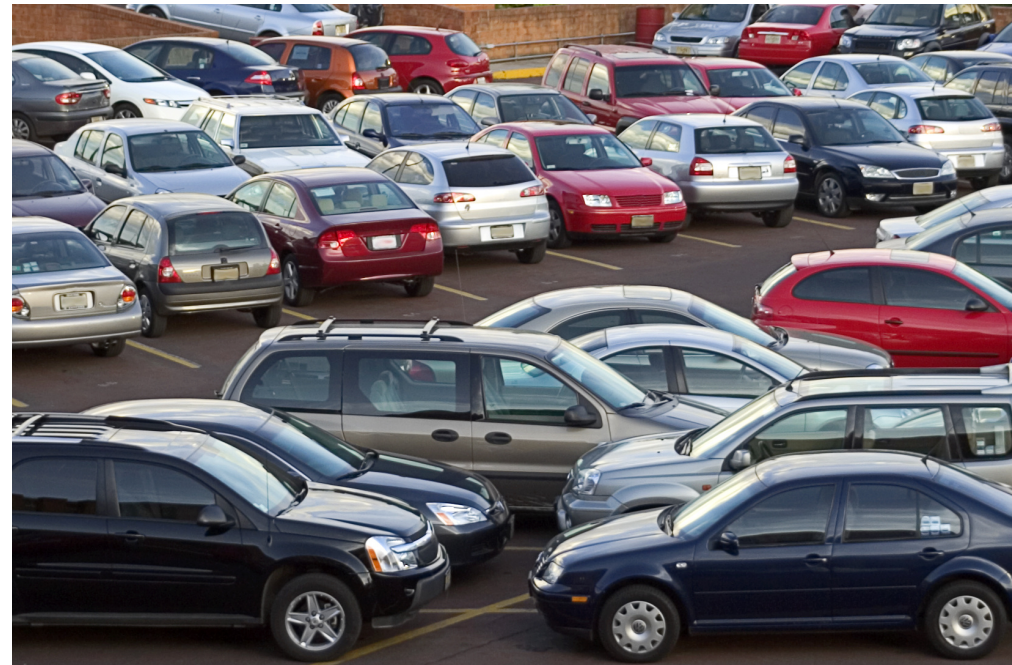
Pictured: Vehicles in a CNE parking lot.