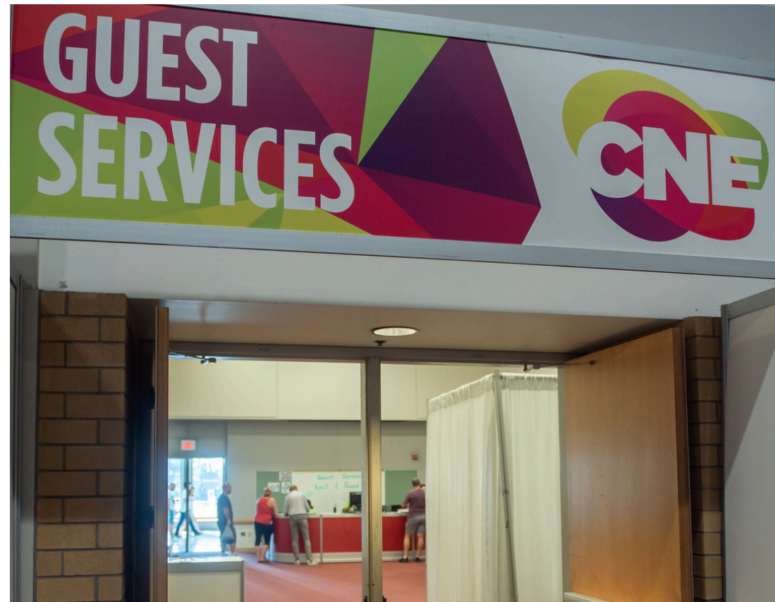
Pictured: Guest Services entrance inside Enercare Centre

The goal is to create an inclusive and supportive experience for all guests, ensuring everyone can enjoy the CNE at their own pace and comfort level.