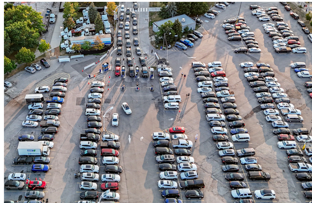
Picture: Vehicles in a CNE parking lot