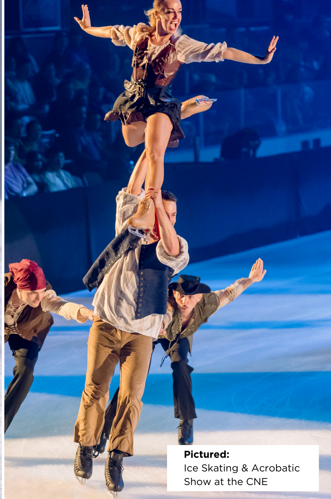
Pictured: Ice Skating & Acrobatic Show at the CNE