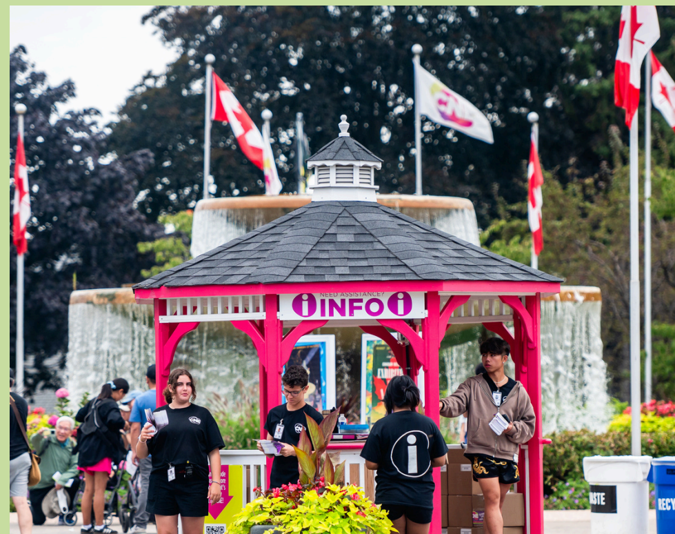
Pictured Above: Info Booth near Bandshell Park

Scouts Canada (which rents wheelchairs and Scooters to guests during the CNE) requires reservations be made in advance by calling 416-263-3090 (June 1 to August 14, 2025), or during the fair.