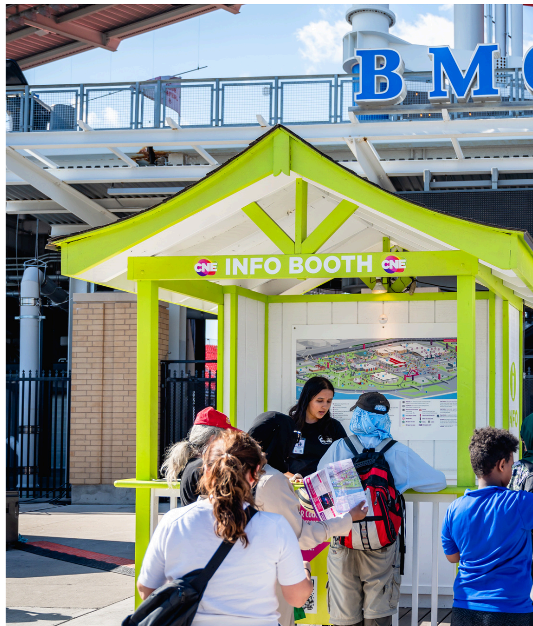
Pictured: CNE outdoor Information Booth with Guest Services Staff

Refer to map on page 40 & 41 for locations