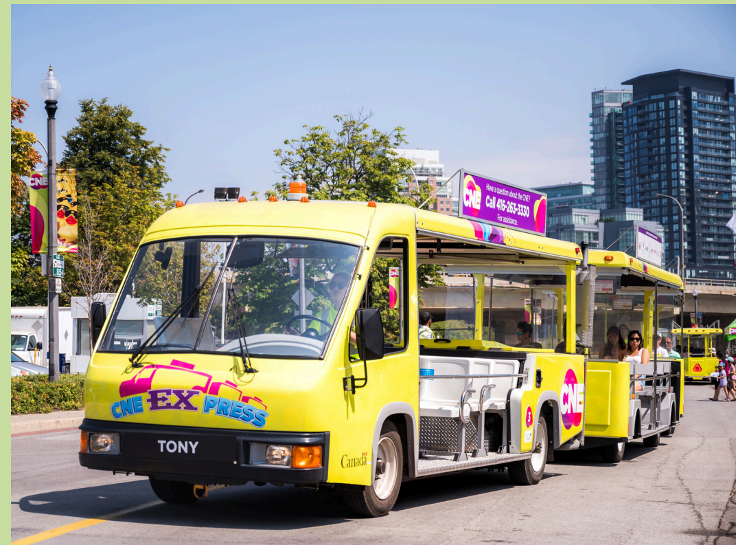
Pictured: CNE EXpress Train

It is possible to connect with the Queen Elizabeth Building, Food Building and Midway from this route.